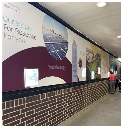
Above: Viewing windows in the hoarding. Below: Visit our marquee at the Learning Festival. Right: The impressive tower crane.

You're invited! The school's Learning Festival, essentially an Open Day, showcases what our students are currently learning through recitals, exhibitions, performances and more. From music to languages, science to art, sport to history... there is something for everyone. We look forward to seeing you!