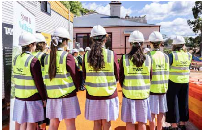
Roseville students participate in the commencement ceremony.

The project also gives our students an opportunity to learn