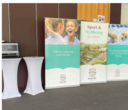
The project's first Community Drop-in was held at the College on 26 November 2022.