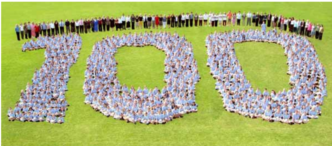
Sitting without hats