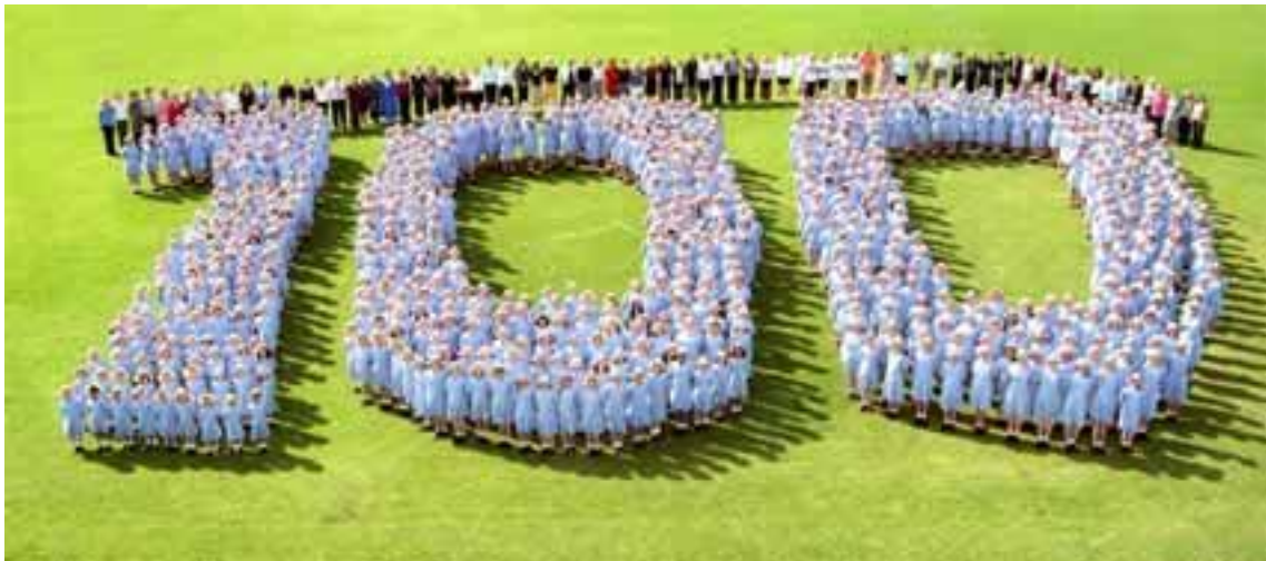
Standing with hats